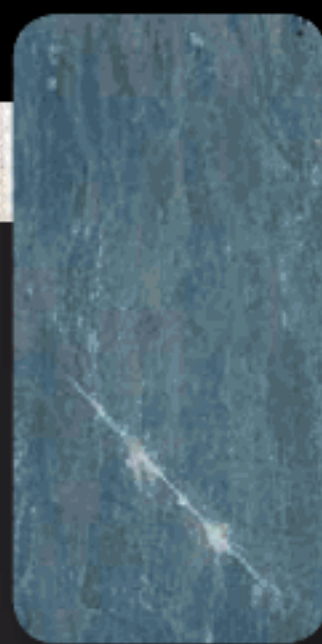
1085 COLD GALVANISING

500 hours salt-spray test (DIN 50021 SS)