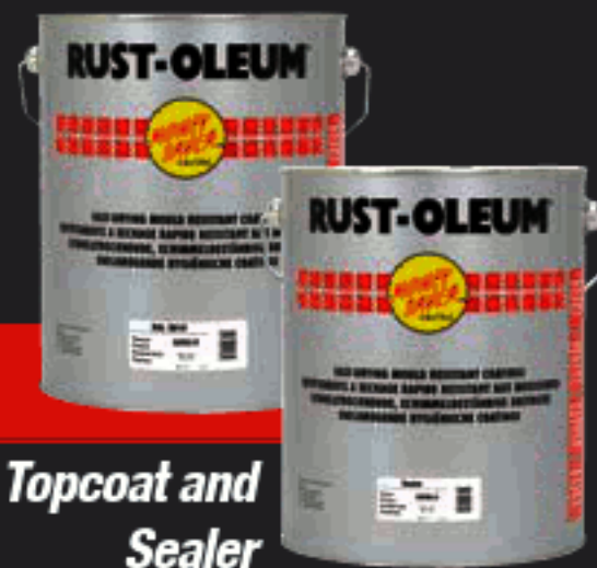
Topcoat and Sealer

Single pack quick drying hygienic coating