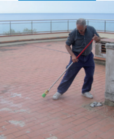
Cleaning a substrate before applying Aquaflex Roof