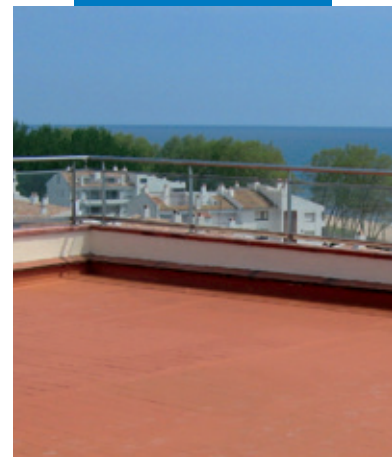
Paving slab waterproofed with Aquaflex Roof