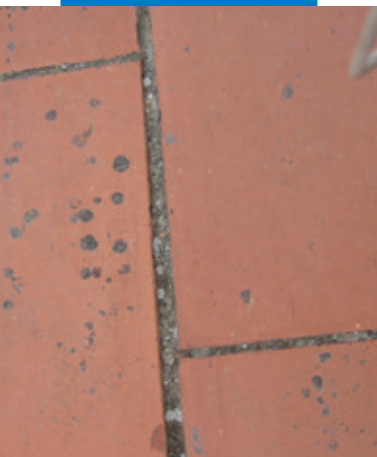
An example of old terracotta floor requiring treatment before applying Aquaflex Roof