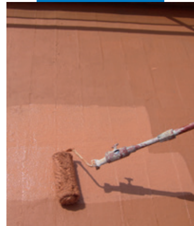
Application of Aquaflex Roof with a long-piled roller