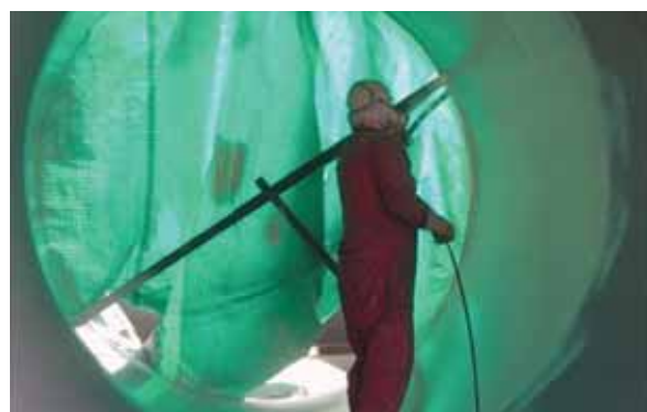
Installation of Ceilcote® 232 Flakeline

To ensure flexible application across a range of substrates a family of ancillary materials are available to support this range.