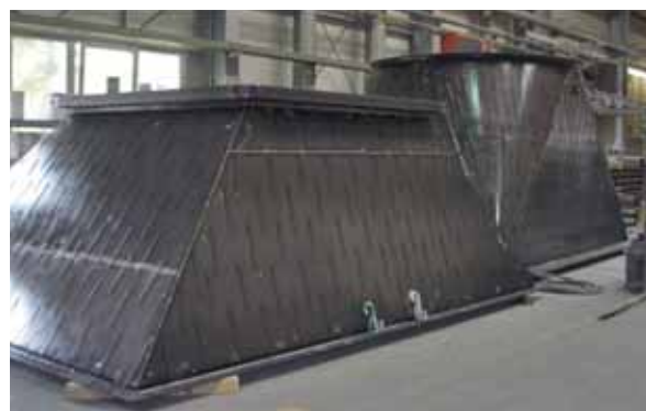
Flue gas ducts and hoods

In cases where solid particles may contribute to additional abrasion, Ceilcote® 282AR Flakeline employs a abrasion resistant ceramic filler to provide additional protection.