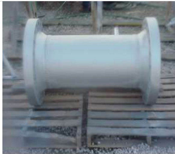
Piping and Pipe Spools