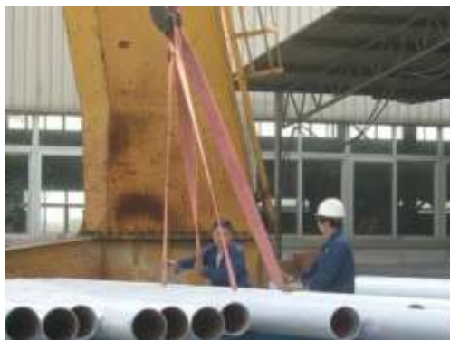
Interbond 1202UPC coated pipe being moved with nylon slings.

As with all coated surfaces, care should be taken during transport. It is recommended that nylon slings are used when moving piping coated with Interbond 1202UPC