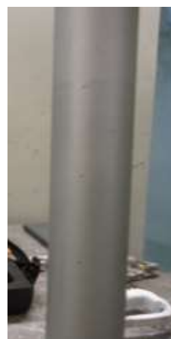
Examples of surface after movement using slings.

Interbond 1202UPC does not need to be overcoated for corrosion performance.