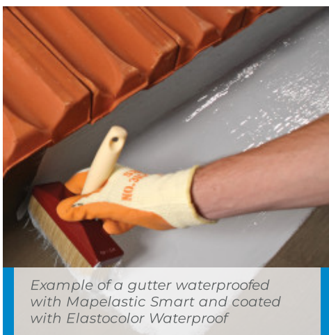
Example of a gutter waterproofed with Mapelastic Smart and coated with Elastocolor Waterproof