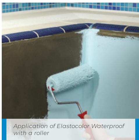
Application of Elastocolor Waterproof with a roller