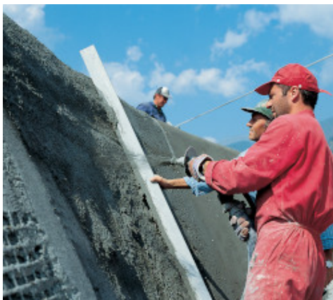
Spray application of MapegROUT T40