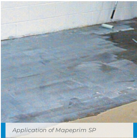
Application of Mapeprim SP