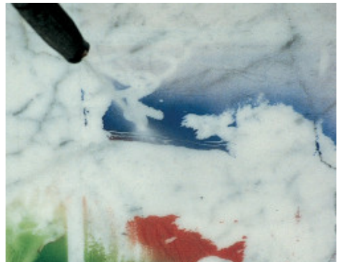
Using a high-pressure cleaner on Carrara marble treated with WallGard Graffiti Barrier