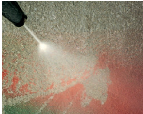
Using high-pressure cleaner on concrete treated with WallGard Graffiti Barrier