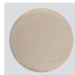
Pass After 14 days at 70°C/158°F with PPG PHENGUARD 985.