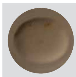
Failed After 14 days at 70°C/158°F with other phenolic epoxy tanklining.