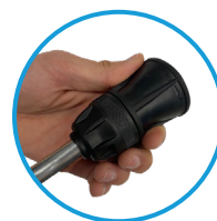
Adjustable Fan Lance