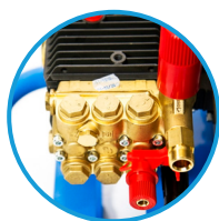
Adjustable Pressure Regulator