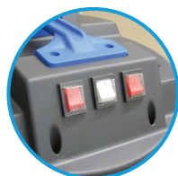
3 Powerful Motors