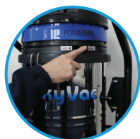
Power Mix: Dual Power Settings