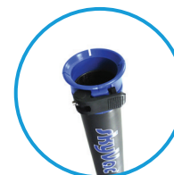
Carbon Fibre Poles