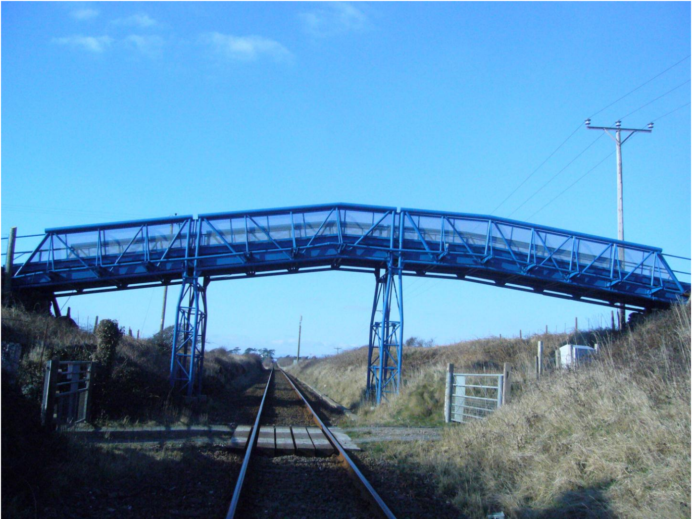
A view of the completed bridge over the railway track