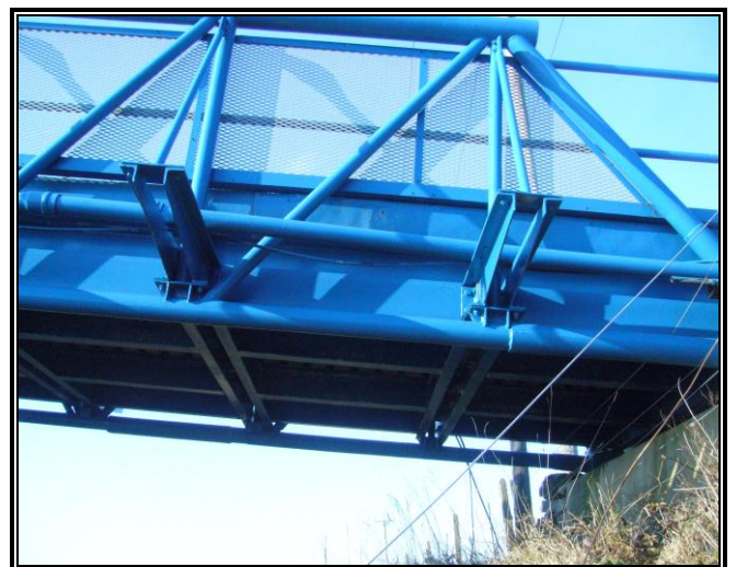
Two views of the completed bridge deck showing both the underside and the side of the deck

The above views illustrate that with the Zinga film-galvanising system the surface finish is as smooth as an automotive finish and any subsequent primers and topcoats will follow on to give a perfect, flaw-free finish every time.