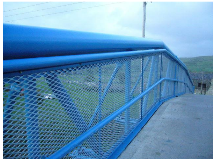
The hand-rails completed with the three-coat system