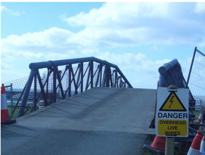
A view of the approach by road