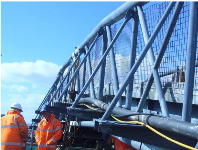
The Zinga layer has been applied on the hand-rails