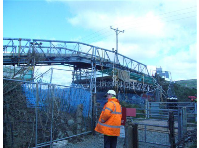
A view of the bridge during blast-cleaning operations