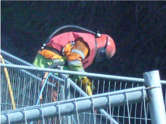
Blast-cleaning the bridge steelwork