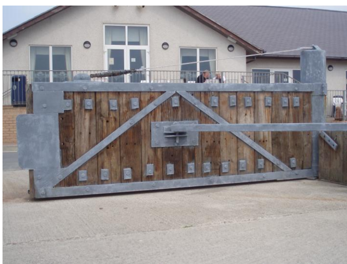
Another view of the tide-gate, showing the locking bar

A view of the tide-gate and the heavy supporting pillar on the Sunnysands beach. An excellent reference for in-situ galvanising. The timbers were removed for blast-cleaning the steel gate-frame and application of the 150µm DFT Zinga. The steel timber-fastening plates were also film-galvanised with Zinga.