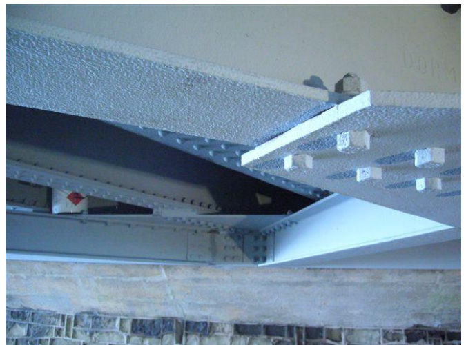
A view of some zingonised beams and fasteners

This was a total refurbishment project, and the entire structure was blast-cleaned and film-galvanised with Zinga. As the bridge is on the coast, the system used was: Zinga : 80µm DFT + Alufer N : 160µm DFT + 2K PU : 60µm DFT Zinga (galvanising layer) + Alufer N (one component MIO PU sealer) + 2K polyurethane (UV resistant finishing coat)