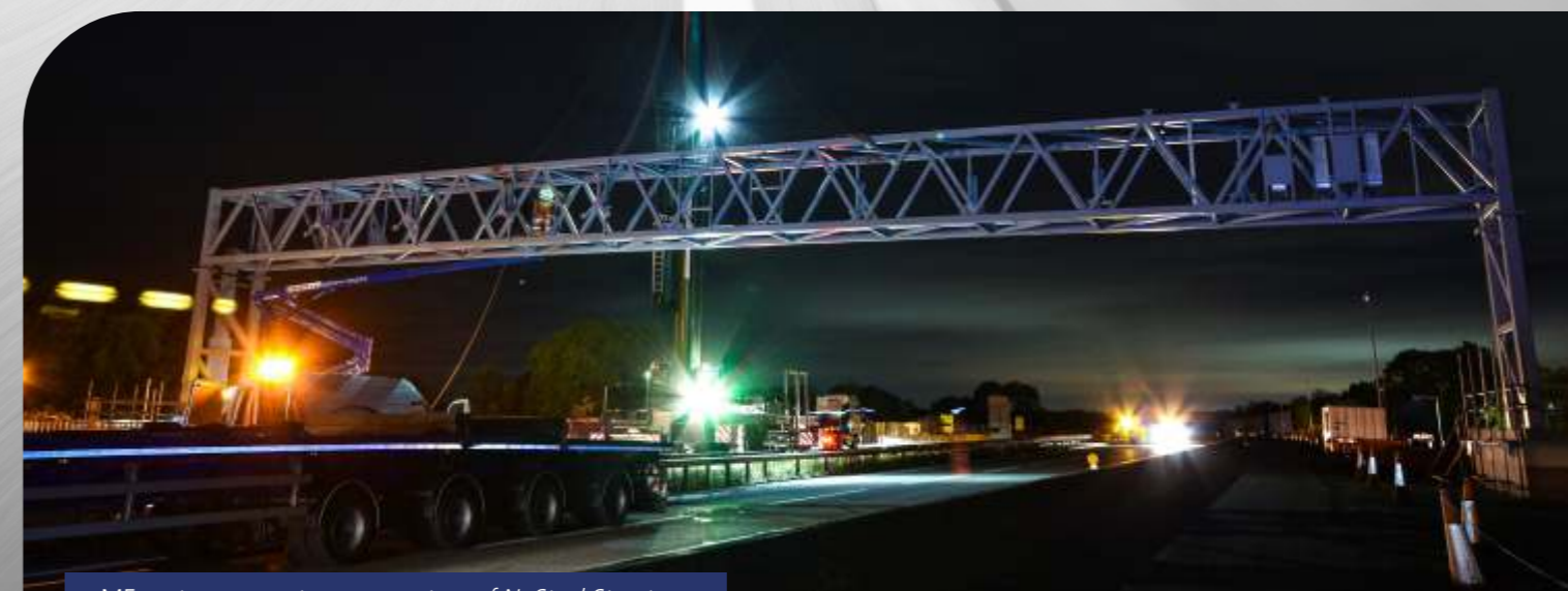
M5 motorway gantry