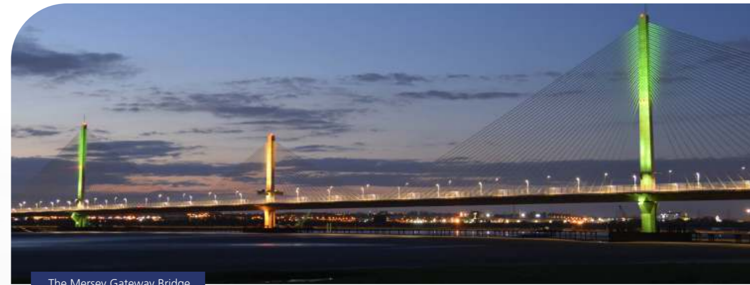
The Mersey Gateway Bridge

** for a non cosmetic finish a second coat of Penguard Express B12 (Item 112) can be used