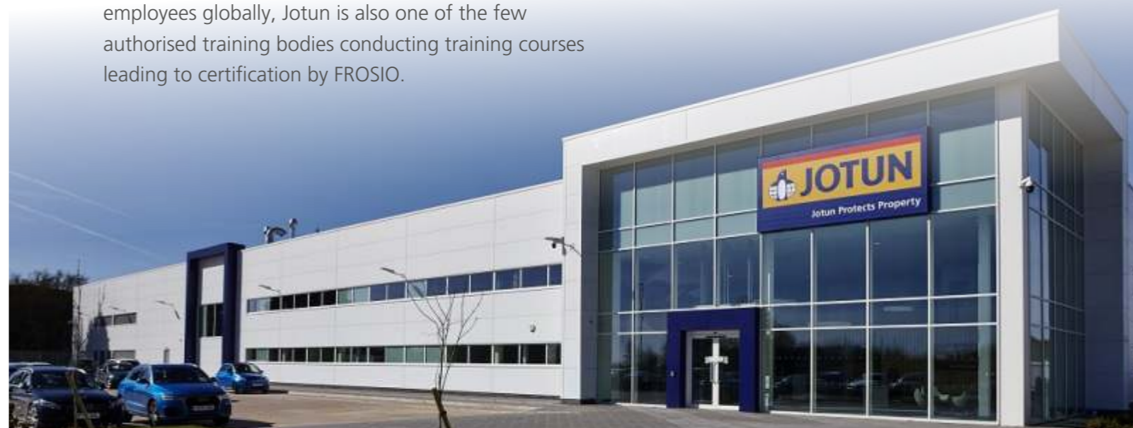
Jotun Factory & PFP Lab - Flixborough, UK