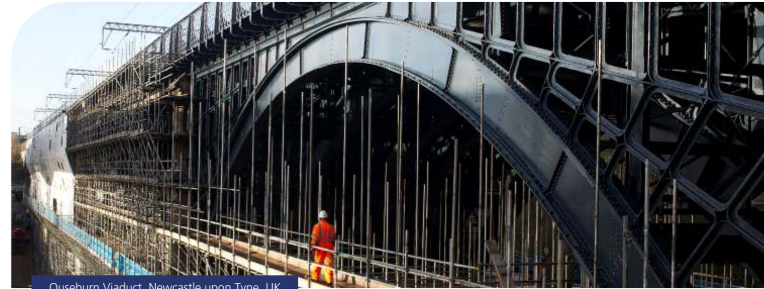
Ouseburn Viaduct, Newcastle upon Tyne, UK

Jotun supply long lasting anticorrosive protective coatings for steel structures for Network Rail. From our approved coating systems you can expect longevity in performance and aesthetics, with options for innovative systems to reduced maintenance programs, all supported by a multi-skilled technical service team covering the UK & Ireland.