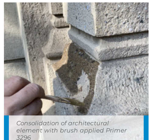
Consolidation of architectural element with brush applied Primer 3296