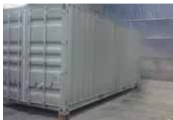
Application of fast cure Interzinc® 22 and tie coat/intermediate coat on day 1

Application of Interzinc® 22 to a steel shipping container was carried out at 19°C (66°F) and 58% relative humidity. The fast cure Interzinc® 22 was ready to overcoat in just under five hours allowing a sealer coat and intermediate coat of Intergard® 475HS to be applied in the same day. This meant that the finish coat, Interthane® 990, could be applied the following day, a full 24 hours earlier than if a conventional, slow drying inorganic zinc silicate had been used.