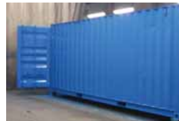
Application of Interthane® 990 finish coat completed on day 2