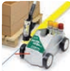
Side striper: To mark pallet edges, walls, etc.