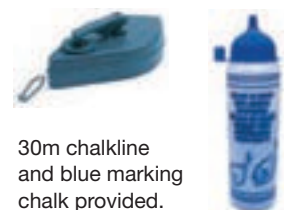
30m chalkline and blue marking chalk provided.