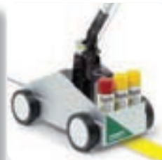
Aerosol holder: For a quick replacement.