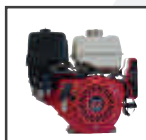
Excellent power & proven reliability