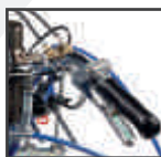
Easy Grip Handle For user comfort