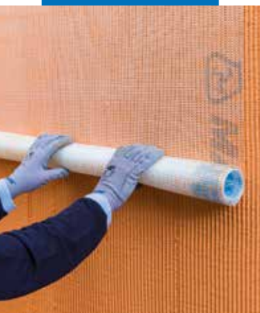
Placing Mapetherm Net in position