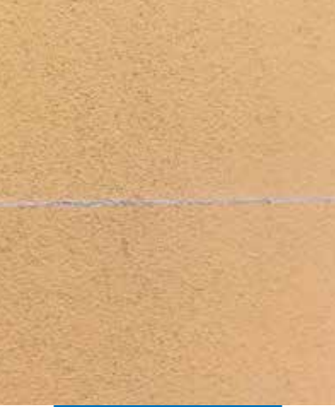
Old cracked cladding

Mapetherm Flex RP is supplied in 20 kg plastic drums.