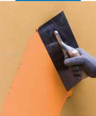
Application of Mapetherm Flex RP