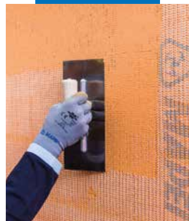
Inserting Mapetherm Net into the wet layer of Mapetherm Flex RP