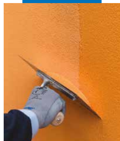
Finishing the surface by applying Elastocolor Tonachino Plus with a trowel over Mapetherm Flex RP 1.5 mm