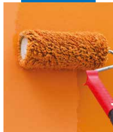
Finishing the surface by applying Silancolor Paint Plus with a roller over Mapetherm Flex RP 0.5 mm